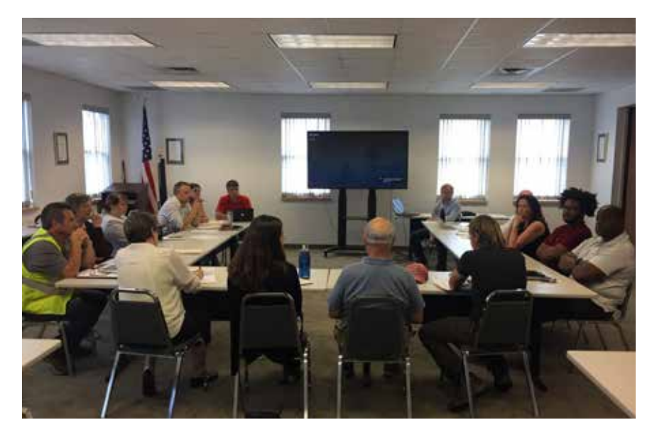
First VLWG Meeting

The first meeting of the VLWG occurred on July 18, 2017 with 24 members in attendance representing public agencies, non-profit service providers, and community-based organizations.