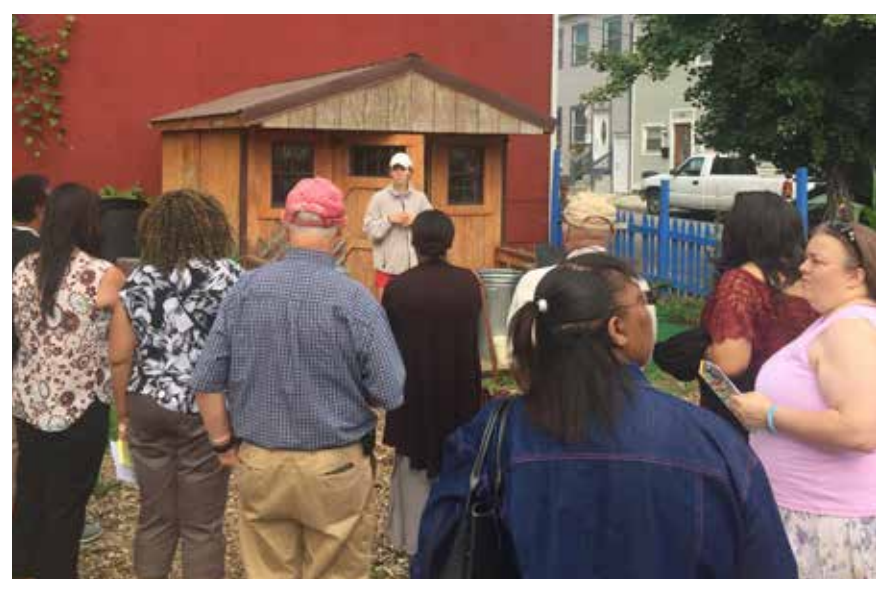
Albany Resident Delegation in Pittsburgh

The roundtable, which was held in Albany in October, was intended to serve as a forum to share highlights from the learning exchange in Pittsburgh; increase understanding of local priorities