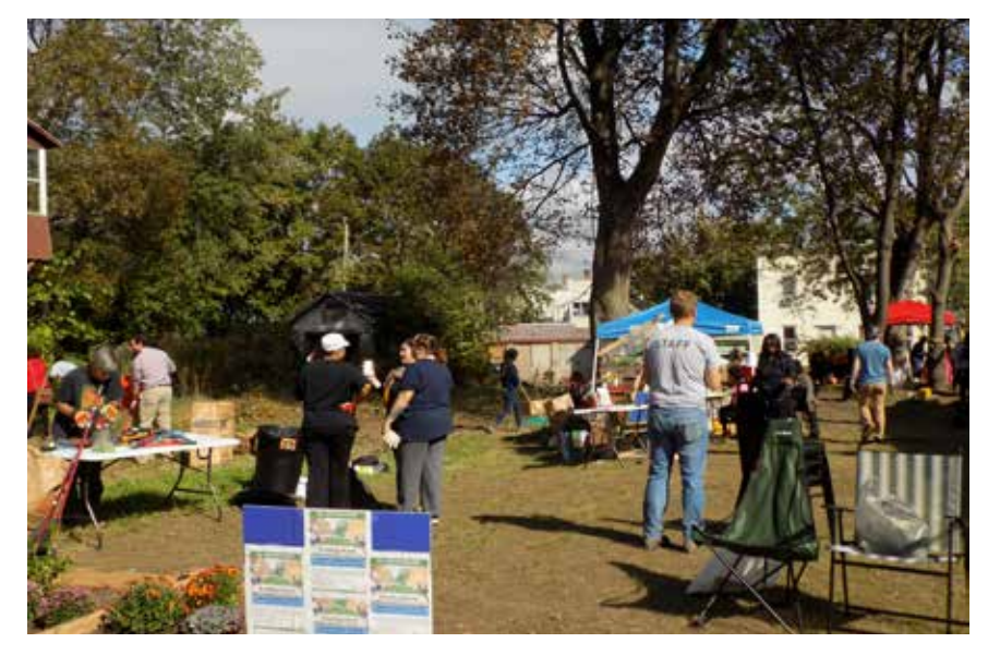
Neighborhood Event, Lots to Do, Lots for You

L2DL4U was an outstanding success. The weather was unseasonably warm, and community members showed up in force to assist with the lot clean up, provide input for the Vacant Land Toolkit, and provide their input on the proposed stewardship program. Through the course of